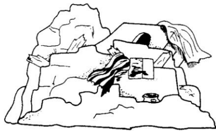
Houses Built on Sand